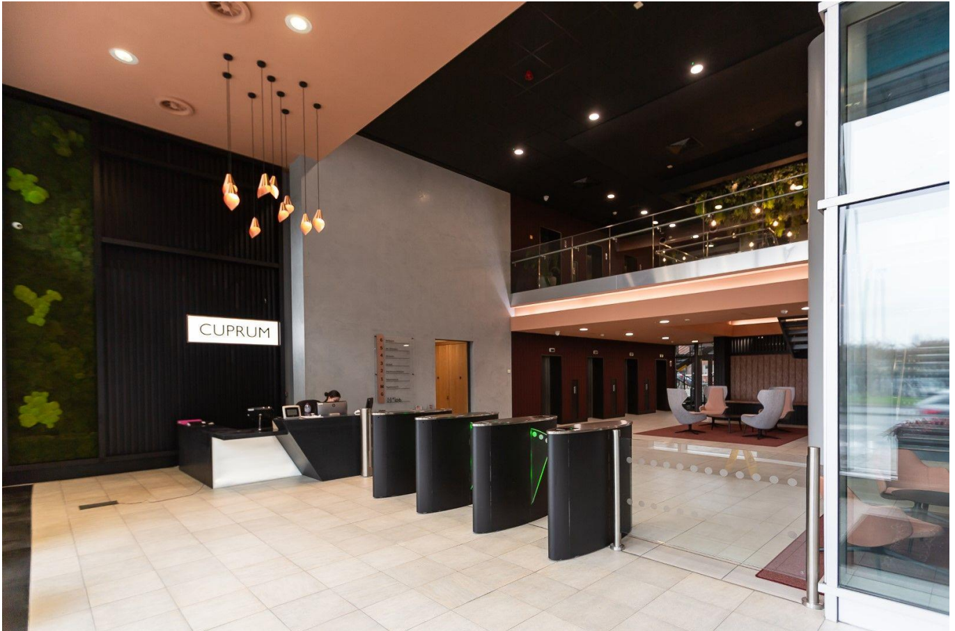
CUPRUM 480 ARGYLE STREET, GLASGOW, G2 8NH